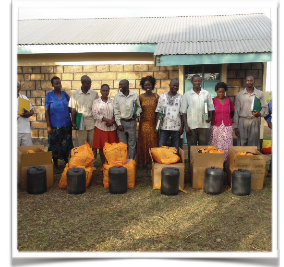
Makini teachers and facilitators

Limited access to safe, affordable and appropriate methods of dealing with menstruation has far reaching implications for many Kenyan adolescent girls. After supplying 145 girls with the Afripad brand of reusable, eco friendly sanitary pads (Fall, 2013) and seeing the positive outcome of uninterrupted school attendance, we knew this was only the beginning of our education/dignity project which we now call the Makini Initiative (dignity in Swahili). With the support of a Rotary Shines World Service grant award as well as Kenya Works donors, the Makini Initiative is reaching 1000 Kenyan girls in Homa Bay and Nairobi County. The program includes pads, panties, soap for washing as well as important information on proper product use and puberty/HIV education.